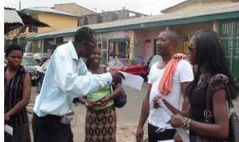
Above: Display of some of the stickers that were distributed by BAOBAB Women's Human Rights and WRAPA. Below: The sticker campaign rally was held at Binukonu Market, Ojota, Ojota in Lagos State.