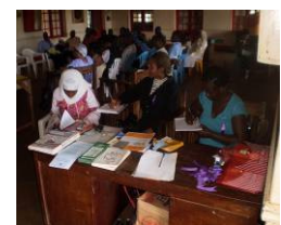
A Training session on the Protocol in Eastern Uganda (Jinja) by Taskforce members Bahai Faith and UMWADD

of the Protocol and to establish a joint partnership between the NGC and the Raising Her Voice National Taskforce. The NGC will have the Maputo Protocol as the theme of its next National Governance Forum in May 2010. It will also take the lead in lobbying the Ministry of Foreign Affairs and the Parliamentary Committee on Foreign Affairs on the urgency of ratification before the July 2010 AU Summit. • The training of grassroots communities and local leaders in Eastern Uganda was undertaken by Uganda Muslim Women Association for Daawa and Development (UMWADD) and Bahai Faith from 15 th -16 th January 2010.