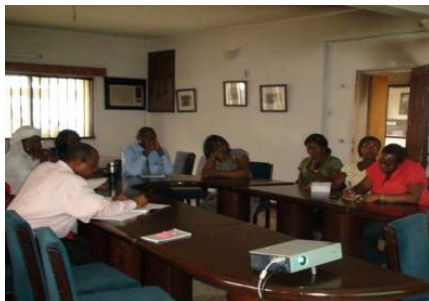
BAOBAB Staff at the in-house training seminar

On 25 th February, 2010 BAOBAB organised an in-house staff seminar on the Maputo Protocol as part of its capacity building initiative to enhance and improve the knowledge of its staff on women’s human rights and other related issues. The trainer shared the gains of advocacy initiatives including those that have led to an increase in the number of women elected into public office. Advocacy strategies identified as useful in carrying out work on the Protocol include simplifying it; continuously presenting it to different stakeholders and organising different fora to sensitise the public on its provisions.