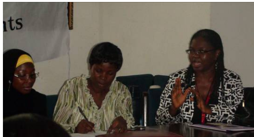
A speaker shares on the Protocol at the RHV sensitisation workshop organized by BAOBAB Women's Human Rights & WRAPA